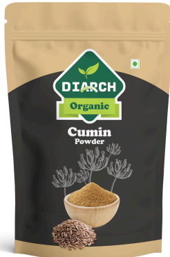
Diarch Organic Cumin Powder