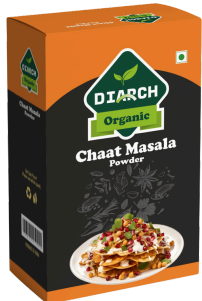
Diarch Organic Chaat Masala

We bring the richness of nature to global markets through our premium range of certified organic agro products. Our products are sourced directly from trusted farmers and processed under strict quality standards to ensure purity, freshness, and sustainability.