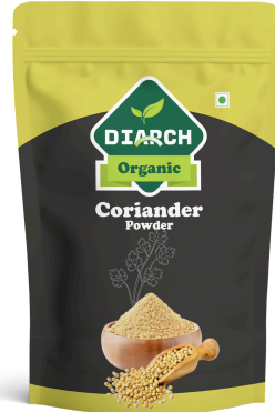
Diarch Organic Coriander Powder