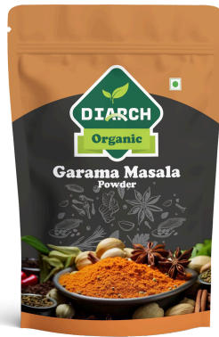
Diarch Organic Garam Masala