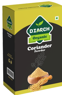
Diarch Organic Coriander Powder