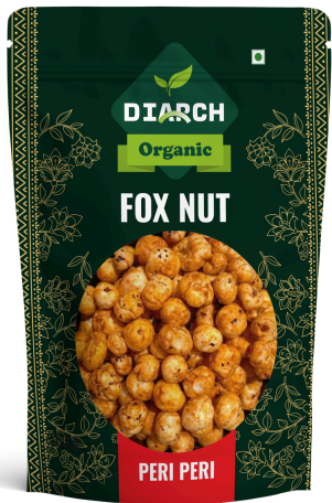
Diarch Organic Fox Nut - Peri Peri