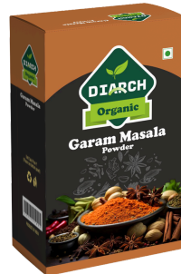
Diarch Organic Garam Masala