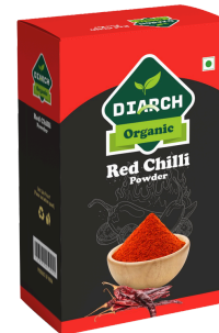
Diarch Organic Red Chilli