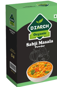
Diarch Organic Sabji Masala