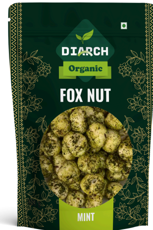
Diarch Organic Fox Nut - Mint