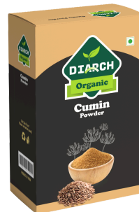
Diarch Organic Cumin Powder