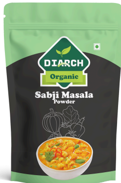
Diarch Organic Sabji Masala