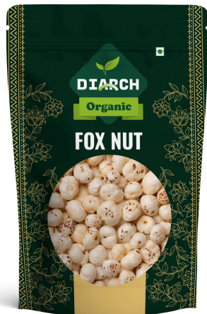
Diarch Organic Fox Nut - Unflavoured