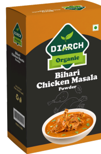
Diarch Organic Bihari Chicken Masala