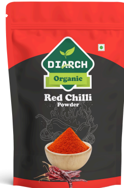
Diarch Organic Red Chilli