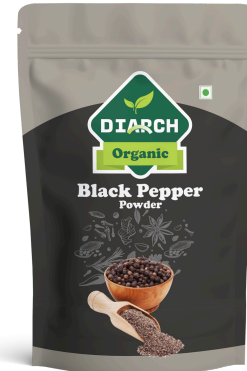
Diarch Organic Black Pepper