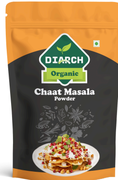
Diarch Organic Chaat Masala