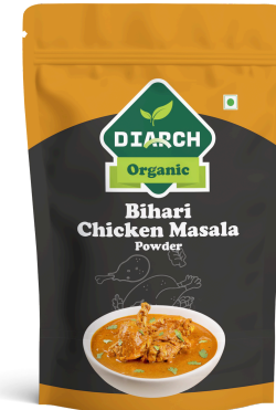
Diarch Organic Chicken Masala