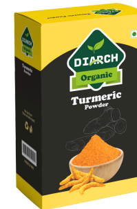
Diarch Organic Turmeric Powder