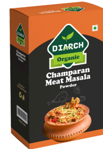
Diarch Organic Champan Meat Masala