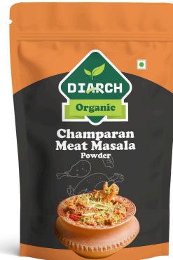
Diarch Organic Meat Masala