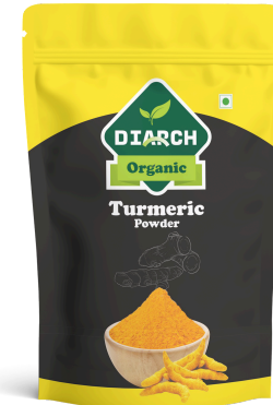
Diarch Organic Turmeric Powder