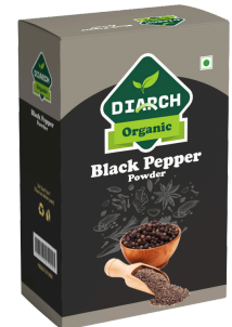
Diarch Organic Black Pepper Powder