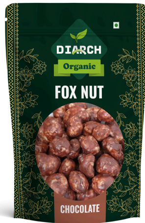
Diarch Organic Fox Nut - Chocolate